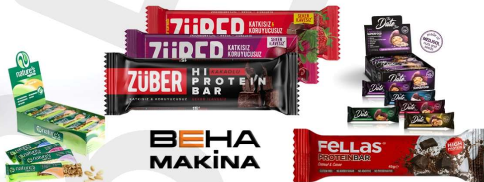
Protein Bar Production Machines